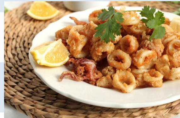
Kalamari (fried squid)