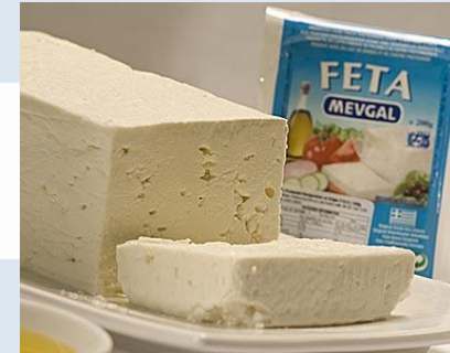
Feta (crumbly cheese)